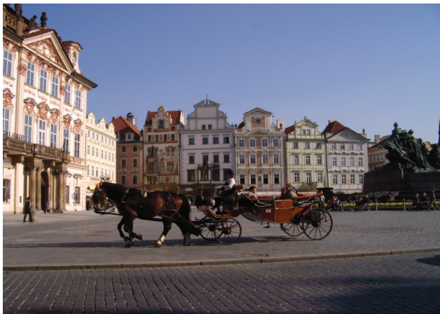
Prague by day and night