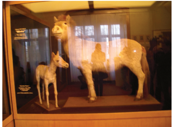
Museum of Hippology